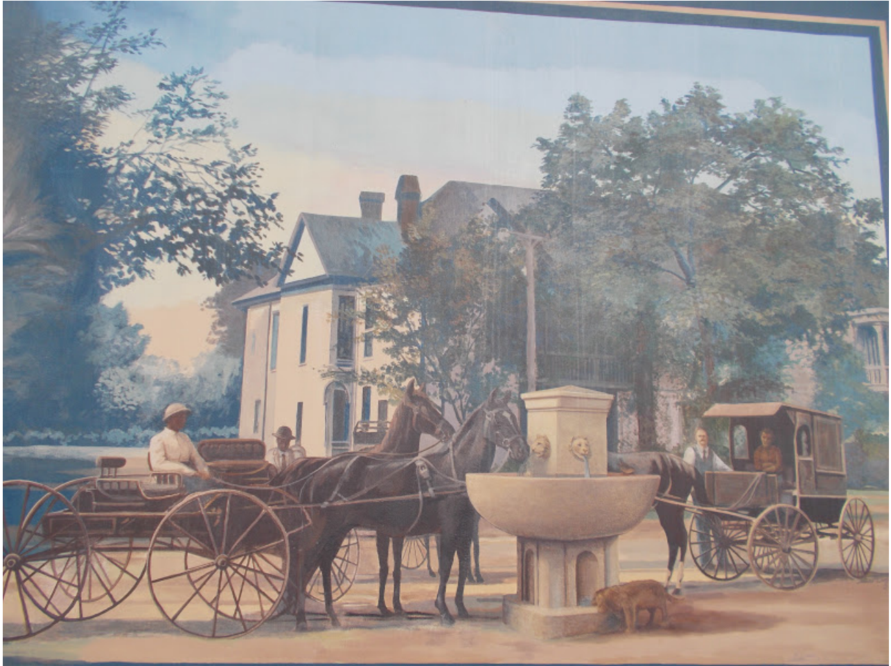
Drinking Fountain as pictured on the Flood Wall

Despite the statement that the fountain would be “shipped at once,” miscommunication with the National Humane Alliance’s secretary delayed the delivery significantly. The Evening Sun reported on December 2, 1907 that the fountain wouldn’t be shipped for another couple weeks, and since it was coming from Maine, that likely put the arrival of the sizable granite structure sometime at the beginning of the new year.