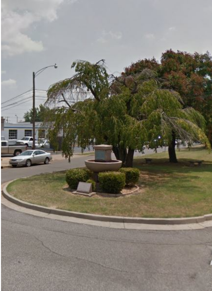
Drinking Fountain Today